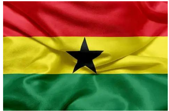
The flag of Ghana

As part of our learning about Ghana and its rich cultural traditions, Year 2 explored the vibrant world of Kente cloth—a colourful woven fabric that tells stories through patterns and colours. Using card and paper strips, the children created their own woven designs inspired by traditional Kente cloth. They learned how colours can carry meaning, how patterns are made through weaving, and how art connects us to people and places around the world.