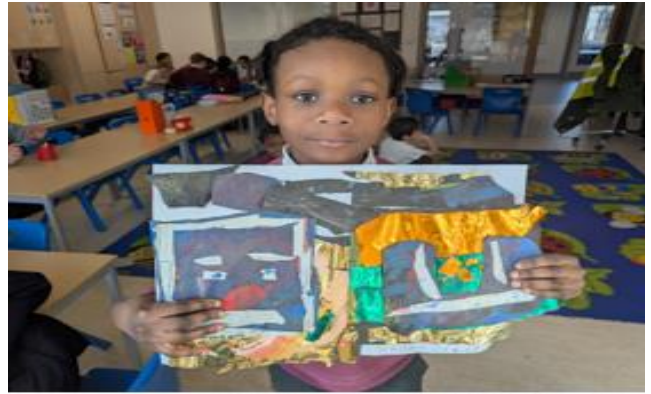
'The Circus' by Israel and Thomas

Tyne class have been composing and arranging collage materials, making choices based on colour and texture. They looked at work from Romare Bearden and then worked collaboratively to produce their own collages.