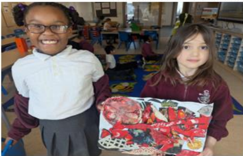
'The Great Fire of London' by Sapphire and Sara