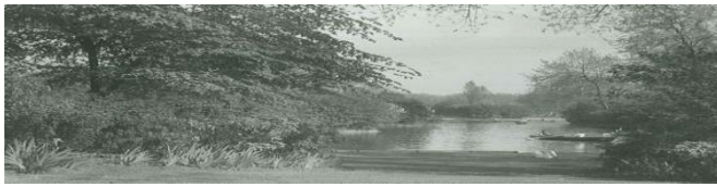
Southwark Park 1936