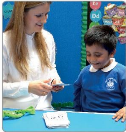
Learning the Speed Sounds in the classroom.