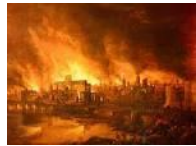
The Great Fire of London